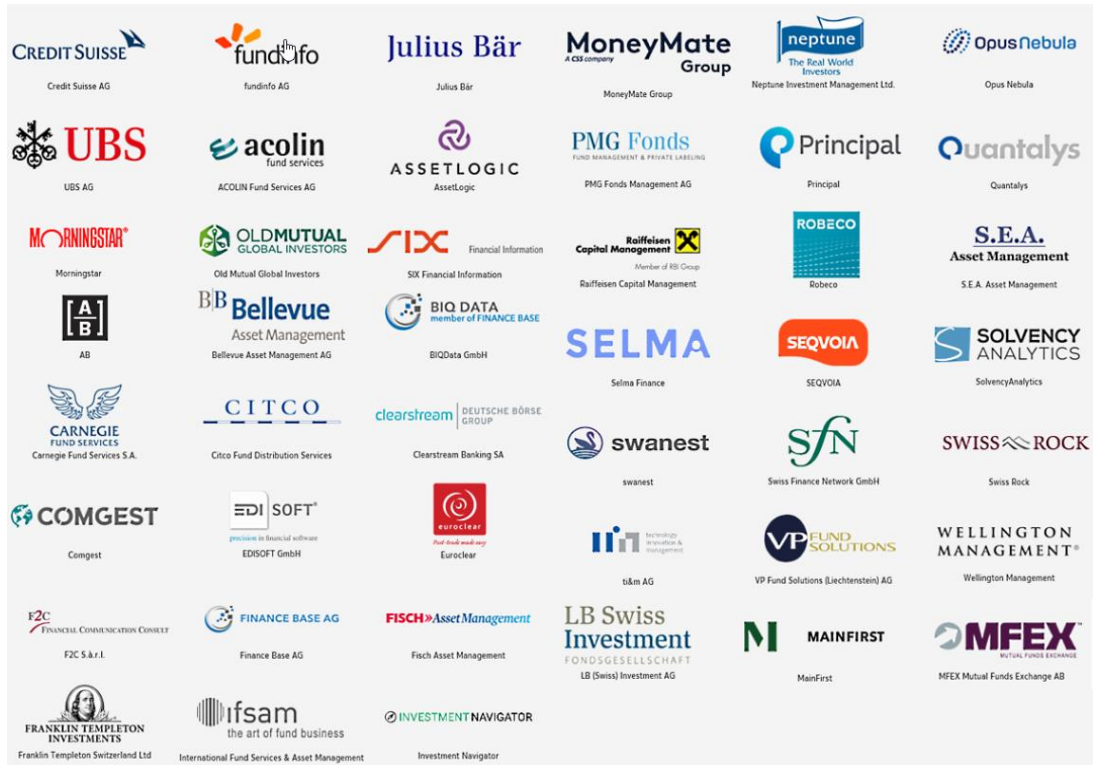
Figure 3: openfunds backers ( click here for the latest member status)

These firms back the openfunds standard for fund data characterisation. They are or will soon be able to send and receive fund data files that comply with the openfunds standard.